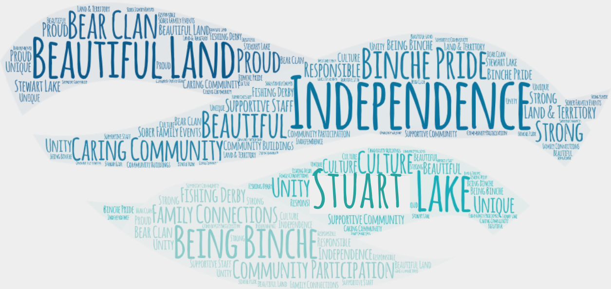
Word clouds images depicting the most frequently mentioned words during the Community Survey